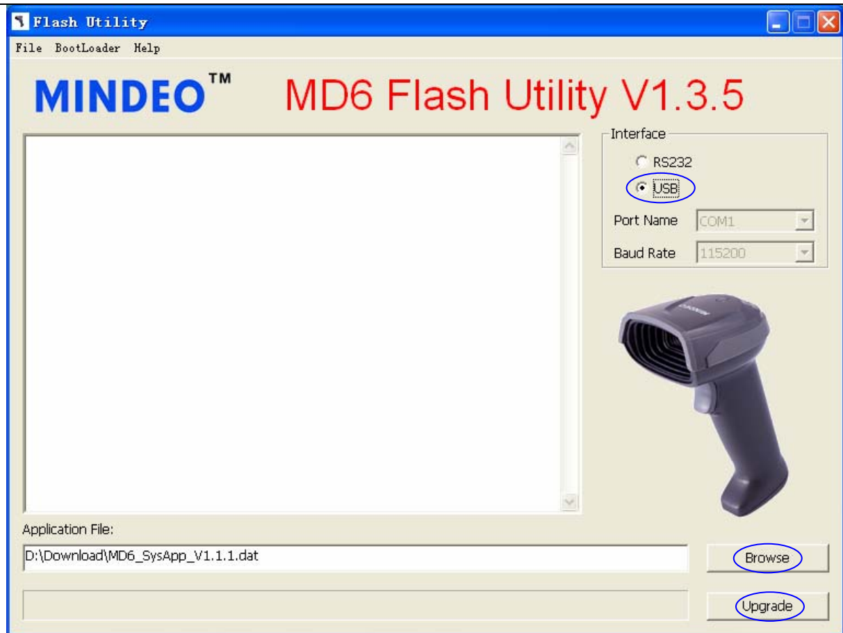
Fig.1 MD6 Flash Utility interface