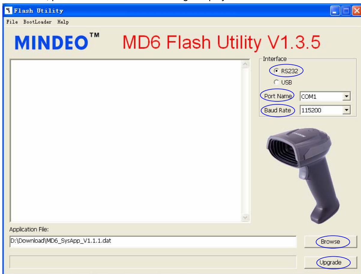
Fig.2 MD6 Flash Utility interface

the meantime the scanner will beep for three times. If the upgrading process is not successful, please refer to the error message displayed.